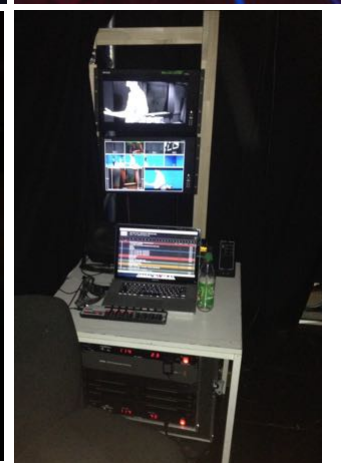
Featured Projects: Helen Lawrence cinematic stage play, CPI launch Twitter Bubbles, Mobile projection system at ISBE Domain, Projection mapped Twitter bar-top, DELETE theatre workshop